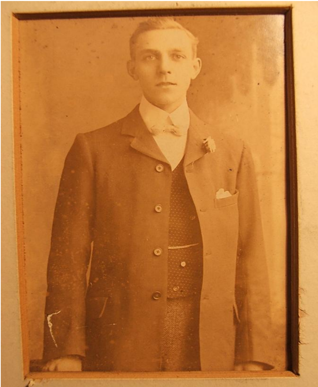
(Identified by relative)

Buried: ..... 14th January 1918 ST. MARY'S CHURCHYARD, South Creake.