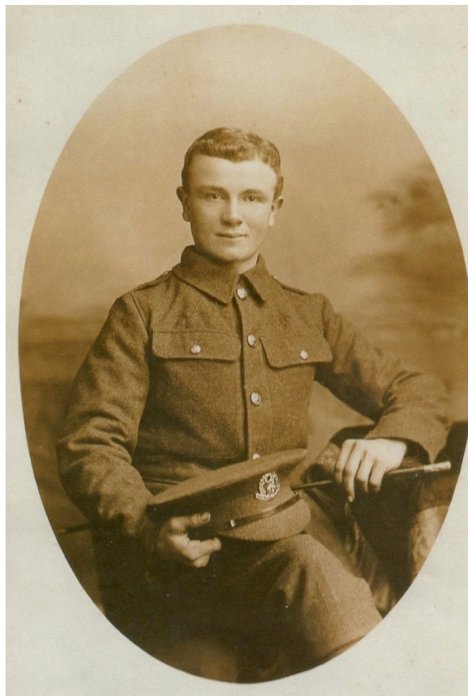
Identified by Relative

Medals: Victory Medal, British War Medal.